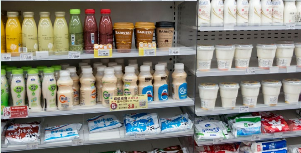
Photo: Dairy products in a convenience store, Shandong General Eccentric via Flickr